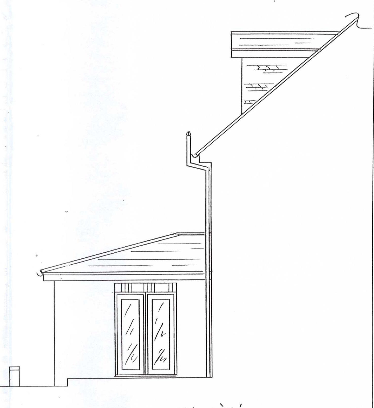
SIDE ELEVATION ON ARROW 'B'

ST0395 / 15 HFUL SOUTH TYNESIDE COUNCIL 22 APR 2015 AREA PLANNING 25 APR 2015 AREA PLANNING